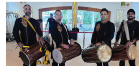
Penang Dhol Blasters , a high-energy Dhol group delivering traditional and modern Bhangra beats.